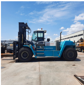
SMV 33-1200C 4 Whl Counterbalanced Forklift >10t

Forkliftcenter Americas Email americas@forkliftcenter.com Phone +507 657 80397