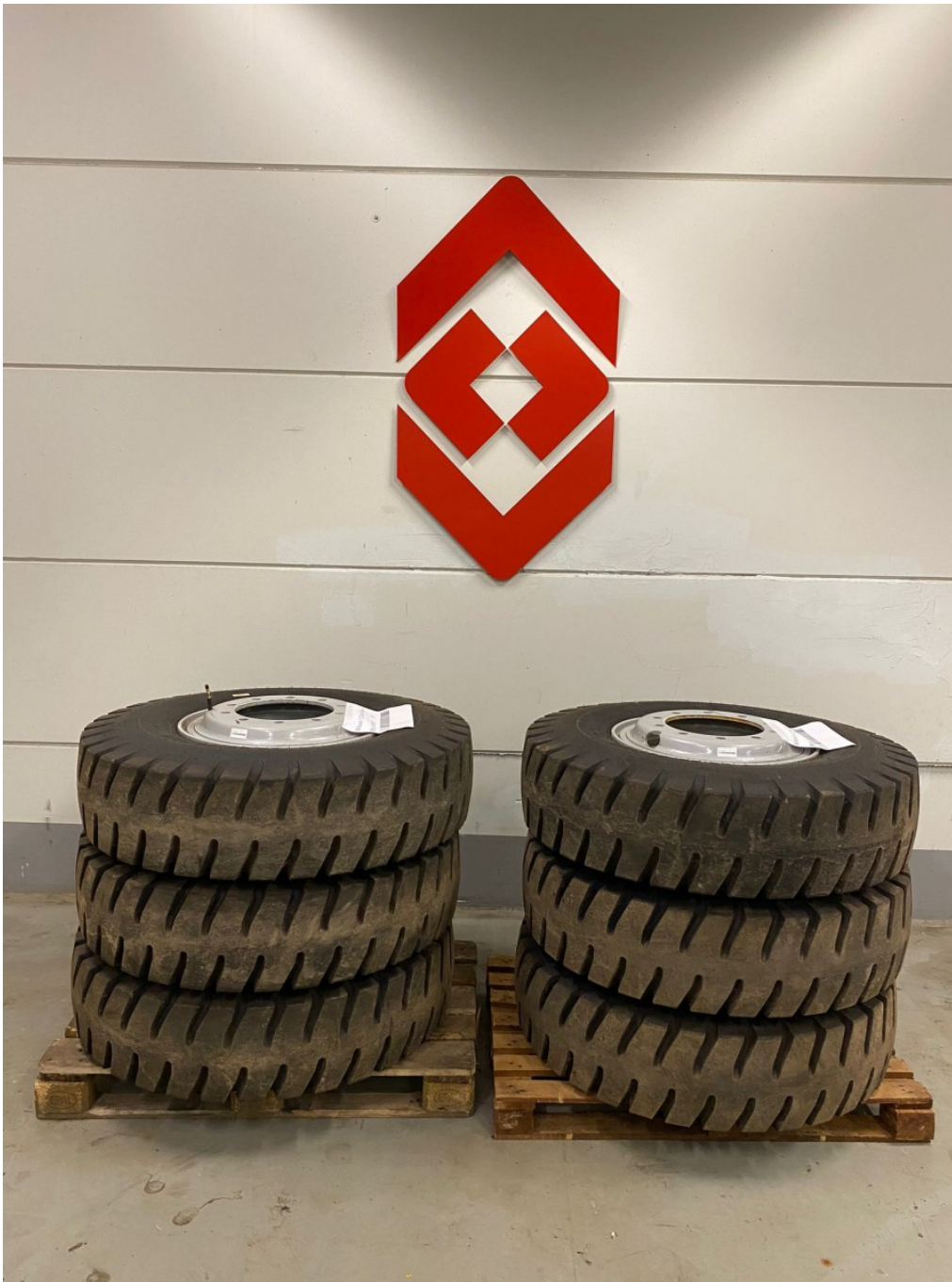
ADVANCE 12.00 - 20 Air tyre with rim NEW Parts

Headquarters Visiting address: Hornweg 18 1045 AR Amsterdam The Netherlands